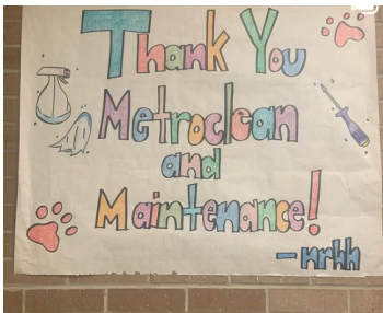
Banner that thanked Metroclean!