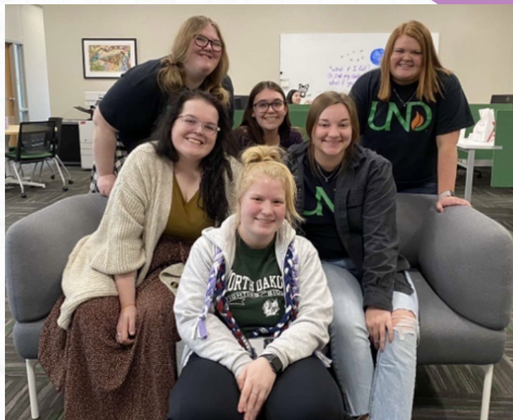
NRHH members after 2022 Give-Thanks-A-Thon event.