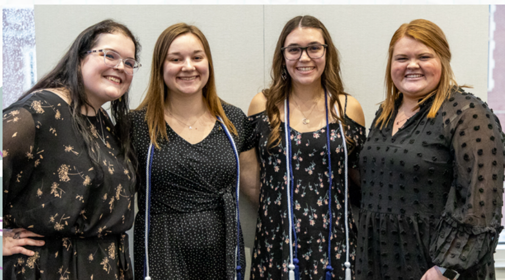
The 2022 exec board at student leadership banquet.