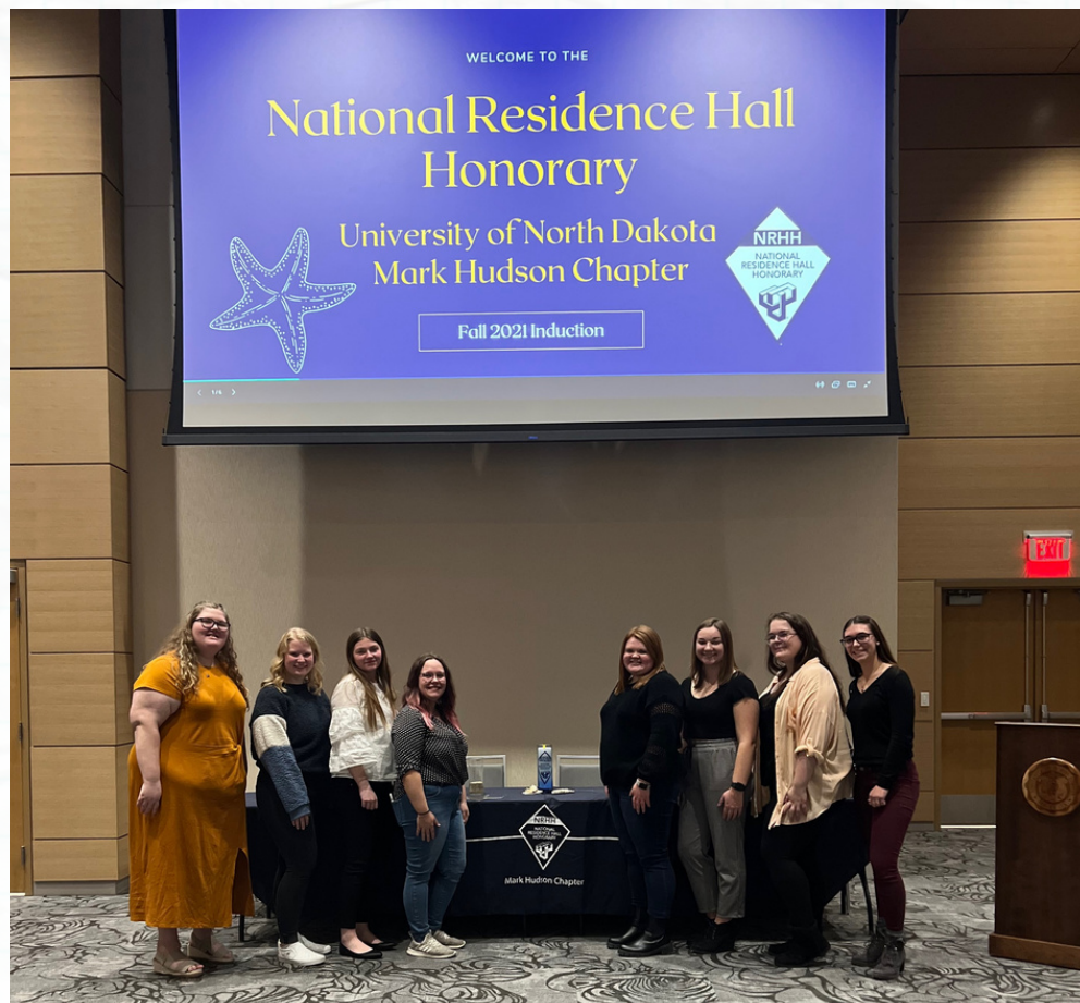
The Mark Hudson Chapter of NRHH having their Fall 2021 induction ceremony.