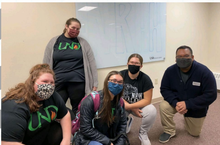
The 2021 exec after a successful event.