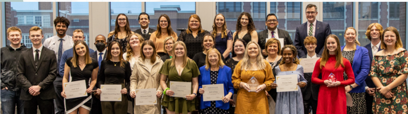
Award winners from 2022 student leadership banquet.