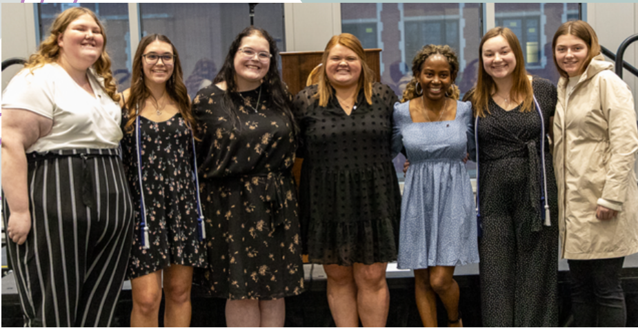
Mark Hudson Chapter attending 2022 Student Leadership Banquet.

Attended NACURH 2020 Attended MACURH RLC 2020 Attended MACURH RBC 2022