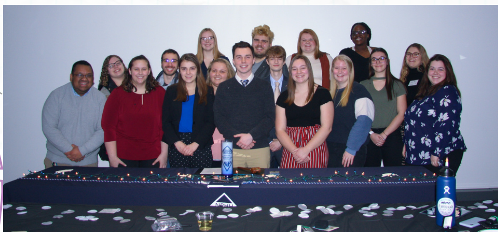
Fall 2019 induction ceremony.