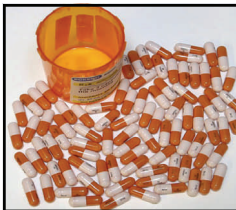
1 out of 20 college students abused amphetamines in the past year.

connotations of amphetamine use are numerous. Firstly, amphetamines are an addictive drug. The more regularly they are used, the higher a person's tolerance become. Amphetamines also can throw off your sleep cycle, weaken your immune system, cause shaking and jitteriness, and make people more irritable.