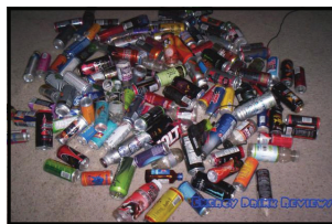
There is a huge variety of energy drinks on the market today.

The new energy drink craze has really taken off within the past couple years. Drinks like Red Bull, Rock Star, Full Throttle, and Monster, will give one a quick boost of energy much like a cup of coffee. These drinks have about the same amount of caffeine per drink as coffee, 80mg, which is enough to keep one awake and studying all night. But it is the other ingredients within the drink that are causing the trend; these other ingredients are: taurine (speeds the heart and muscle fibers), glucuronolactone (naturally found in the body), sugar (you know what this does), and some contain guarana (a