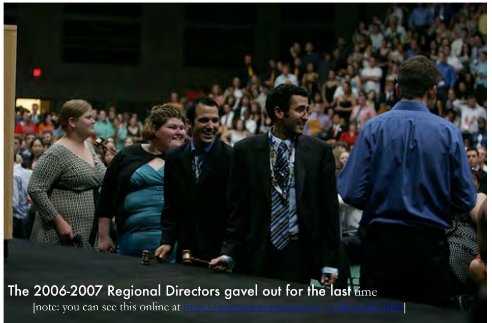
The 2006-2007 Regional Directors gavel out for the last time

[note: you can see this online at http://youtube.com/watch?v=OB6uuM1rRU ]