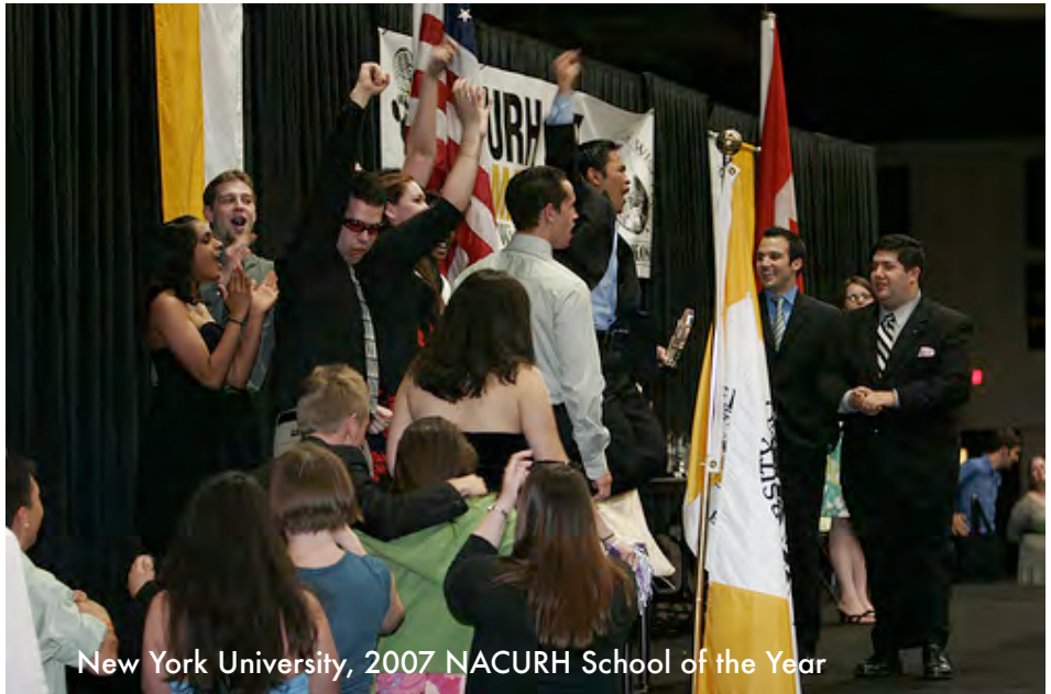
New York University, 2007 NACURH School of the Year

However, what truly differentiated NYU this year from any other year in the past was its exceptional involvement on the regional and national level. For the first time ever, NYU hosted a Sub-Regional Meeting that attracted a record number of students from all over New York. NYU created award winning banners (1 st place at NEACURH 2006 and then 3 rd place at Mini No-Frills 2007), submitted