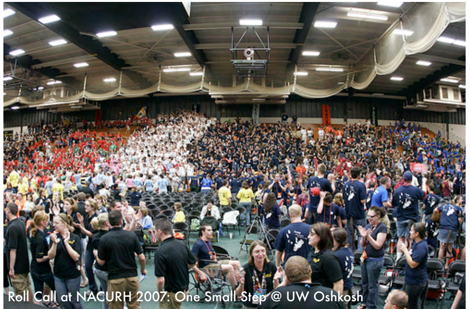
Roll Call at NACURH 2007: One Small Step @ UW Oshkosh