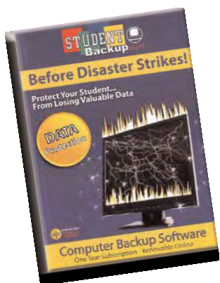
STUDENT BACKUP COMPUTER BACKUP SOFTWARE