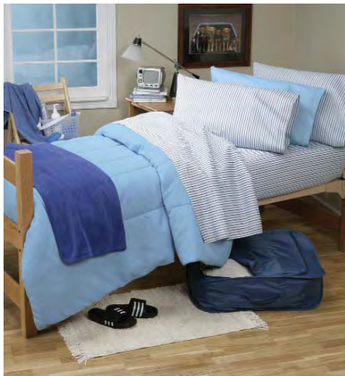
RESIDENCE HALL LINENS RESIDENCE HALL CARPETS