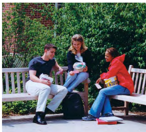
CARE PACKAGE PROGRAMS