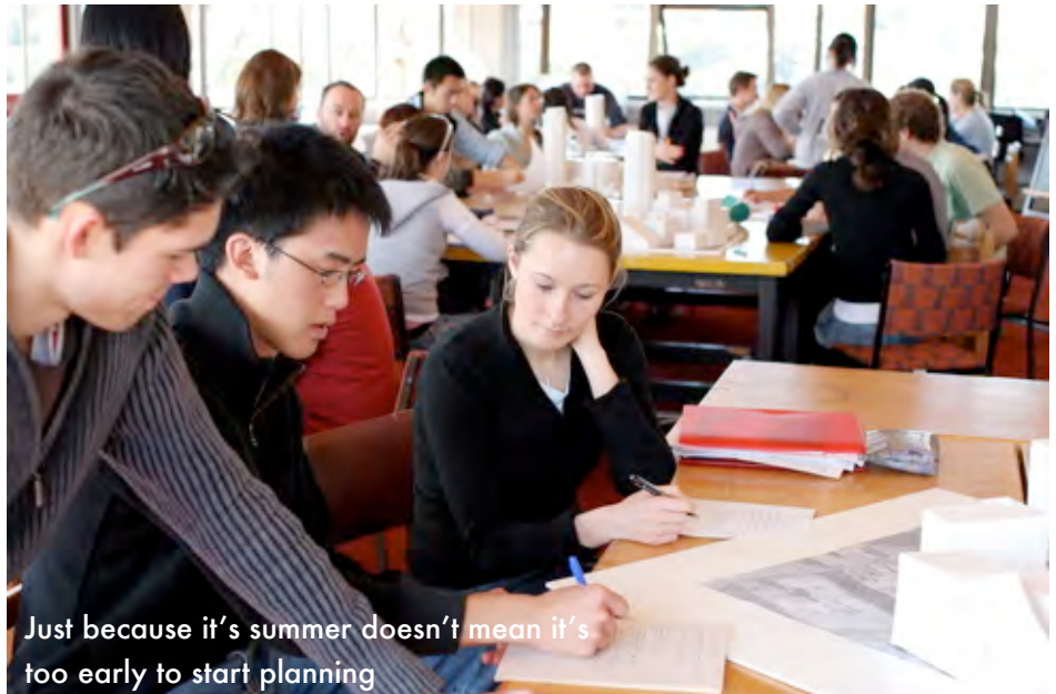
Just because it's summer doesn't mean it's too early to start planning

the best medicine for anyone who is either stressed or someone who is just plain burnt out from the same old routine. Taking some quality fun time can be very healthy and helpful when trying to organize, communicate, and recognize others. When an individual takes time to relax they are able to come back to their work with a rejuvenated look on the project at hand. A new outlook on a project after taking some time off can help foster new ideas, new directions, and sometimes a brand