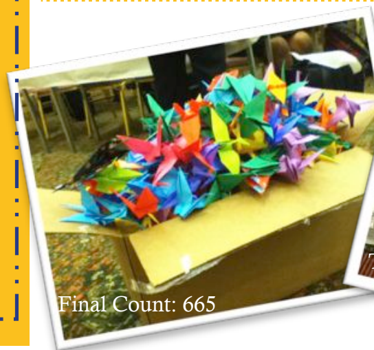
Final Count: 665