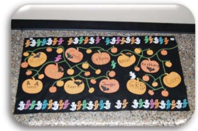
FSU SAACURH 2008 Banner