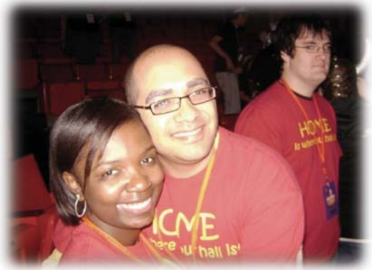
At SAACURH 2008